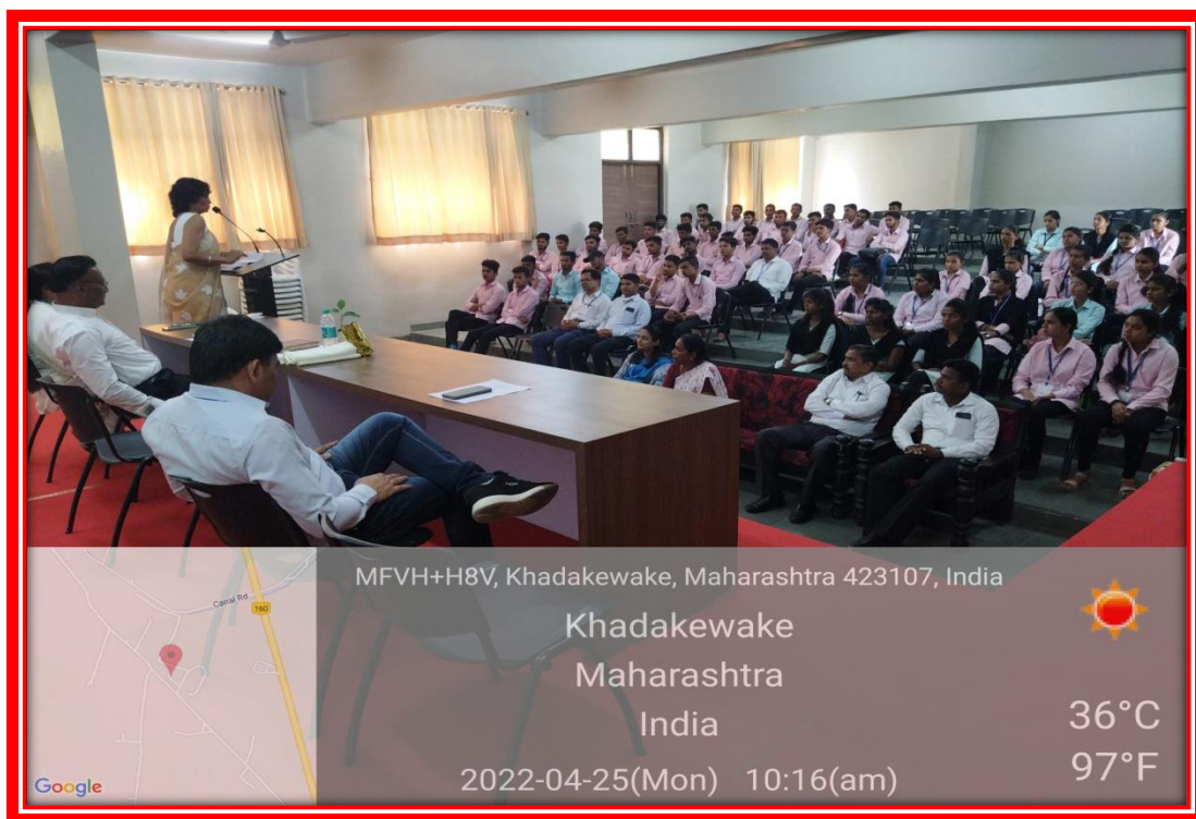
Student Participants at the occasion